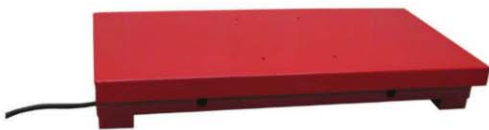
Lowers to 7½" w/o wheels 12" w/wheels

The 240 Industrial Lift has a table top dimension of 24" W x 48" L, which will raise loads of 700 lbs. to a height of 42" in 27 seconds. The table surface may be raised or lowered, with a convenient foot pedal, which leaves hands free to safely perform other tasks.