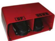
GUARDED FOOT PEDAL

TOOL TRAY 16010 Keeps tools organized & handy. 39¾" x 7" x 1¾". Wt. 20 lbs.