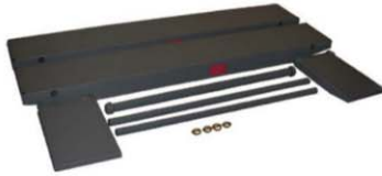
12" SIDE EXTENSIONS

CV-17 CYCLE VISE 14476 Position your cycle upright. Vise opening 7½". W: 21" x L:15". Wt. 37 lbs.