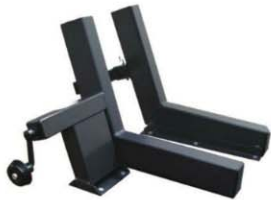
CV-17 CYCLE VISE

CV-17 CYCLE VISE 14476 Position your cycle upright. Vise opening 7½". W: 21" x L:15". Wt. 37 lbs.