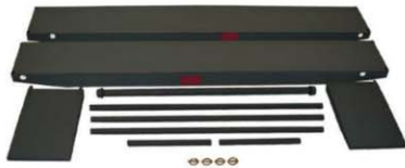
12" SIDE EXTENSIONS