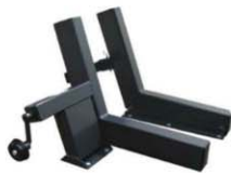
CV-17 CYCLE VISE 14476 Position your cycle upright. Vise opening 7½" W: 21" x L:15". Wt. 37 lbs.