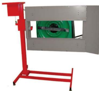
12" center opening