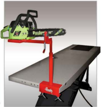
Chain saw attachment