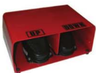
GUARDED FOOT PEDAL

TOOL TRAY 16010 Keeps tools organized & handy. 39¾" x 7" x 1¾". Wt. 20 lbs.