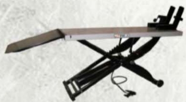
Shown with CV-17 Cycle Vise

This SPORT LIFT was developed for the specialty market of lighter sport bikes, dirt bikes, street bikes and scooters and has a 750 lb. capacity. This lift has a 74" length and a 23" width top making it ideal for your home garage or shop. Includes CV-17 Cycle Vise.