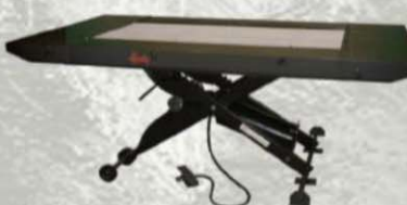
Shown with CV-17 Cycle Vise

The GRUNTAVORE 1800 AIR LIFT is a full 104" in length and has a width of 60", making it ideal for all models of UTVs, ATVs, garden tractors, and lawn care equipment. Lifting capacity is 1800 lbs.