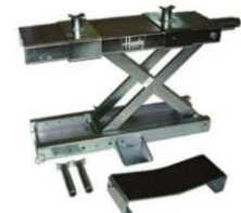
UNIVERSAL SCISSOR JACK 13008 Use on lift or on floor Wt. 43 lbs.