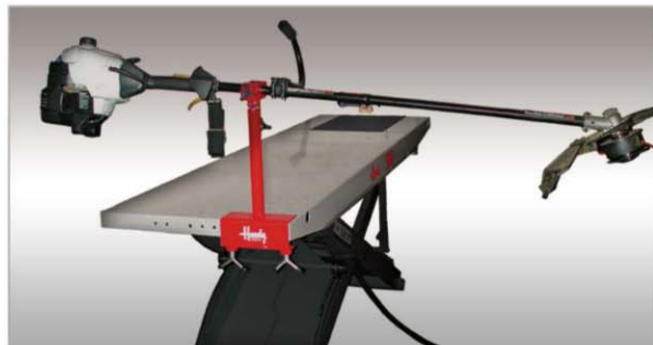
Weed cutting attachment