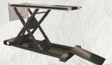
Shown with CV-17 Cycle Vise

The HYDRAULIC ELECTRIC 1500 LIFT raises 1500 lbs. up to 48". The self-storing rear drop-out panel is ideal for easy tire changing and the 18" front drop down gives you easy access to your bikes front wheel and fork.