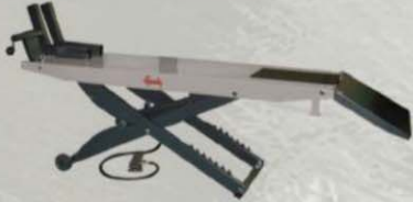
Shown with CV-17 Cycle Vise

The S.A.M. 1000 Lift has a convenient drop-out panel for making tire removal easy. It is also 4" longer than our Standard Lift to accommodate longer wheel bases. Electric and CE approved models available.