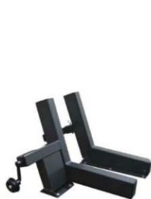
CV-17 CYCLE VISE 14476 Position your cycle upright Vise opening 7½" W: 21" x L:15". Wt. 37 lbs.