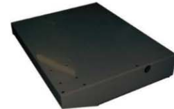
13" FRONT EXTENSIONS