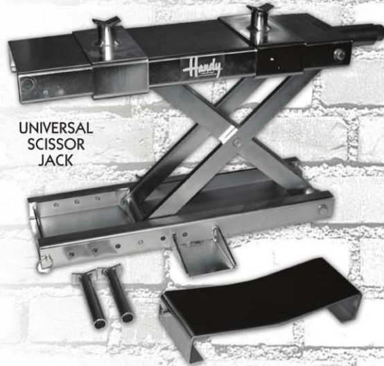
UNIVERSAL SCISSOR JACK