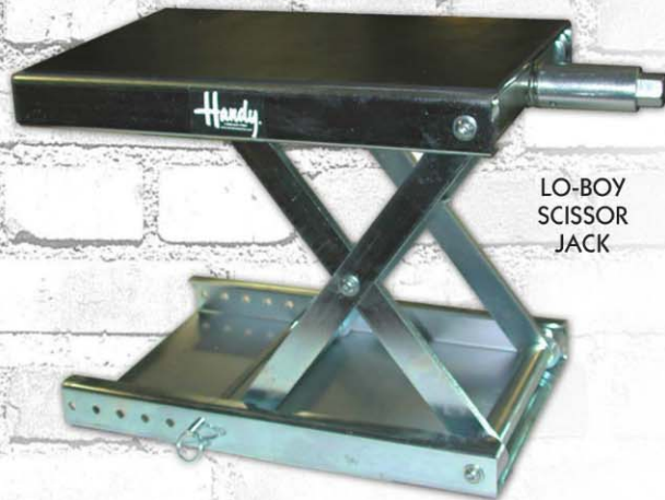
LO-BOY SCISSOR JACK