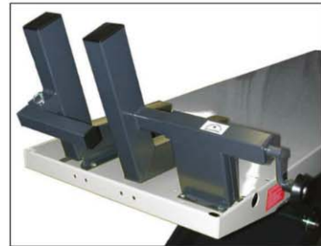
CV-17 CYCLE VISE 14476 Position your cycle upright Vise opening 7½" W: 21" x L:15". Wt. 37 lbs.

The CV-17 Cycle Vise is included with this lift