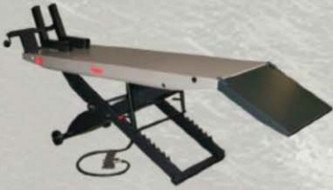
Shown with CV-17 Cycle Vise

The STANDARD 1000 LIFT has a lifting capacity of 1000 lbs. and an 80" x 24" deck, making it ideal for working on motorcycles, ATVs, garden tractors and snowmobiles. Electric and CE approved models available.