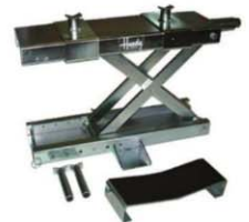
UNIVERSAL SCISSOR JACK 13008 Use on lift or on floor Wt. 43 lbs.