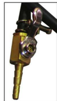
Barb nozzle connection

Adjustable height base to hook lowest height 48" peak height 76"