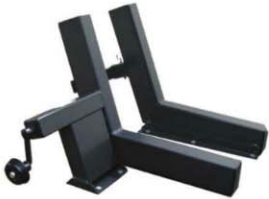
CV-17 CYCLE VISE

Customize your S.A.M. 1000 with these attachments