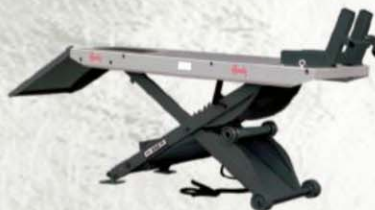
Shown with CV-17 Cycle Vise

The B.O.B 1500 AIR LIFT raises to 40" and lifts 1500 pounds for the fully-dressed motorcycles and trikes. It has a drop-out for convenient tire changes. The lift is a full 7' long, with a width of 28". CE approved model available.