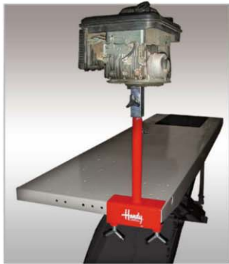
Mower motor attachment

The Handy Lawn and Garden Tool Kit provides a “third hand” for handling your lawn and garden equipment.