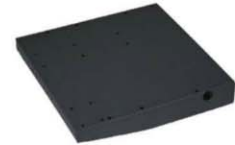
13" REAR EXTENSIONS

13" FRONT EXTENSION 16011 Extends lift top to 93". W: 24½" x L: 24" Wt. 29 lbs.