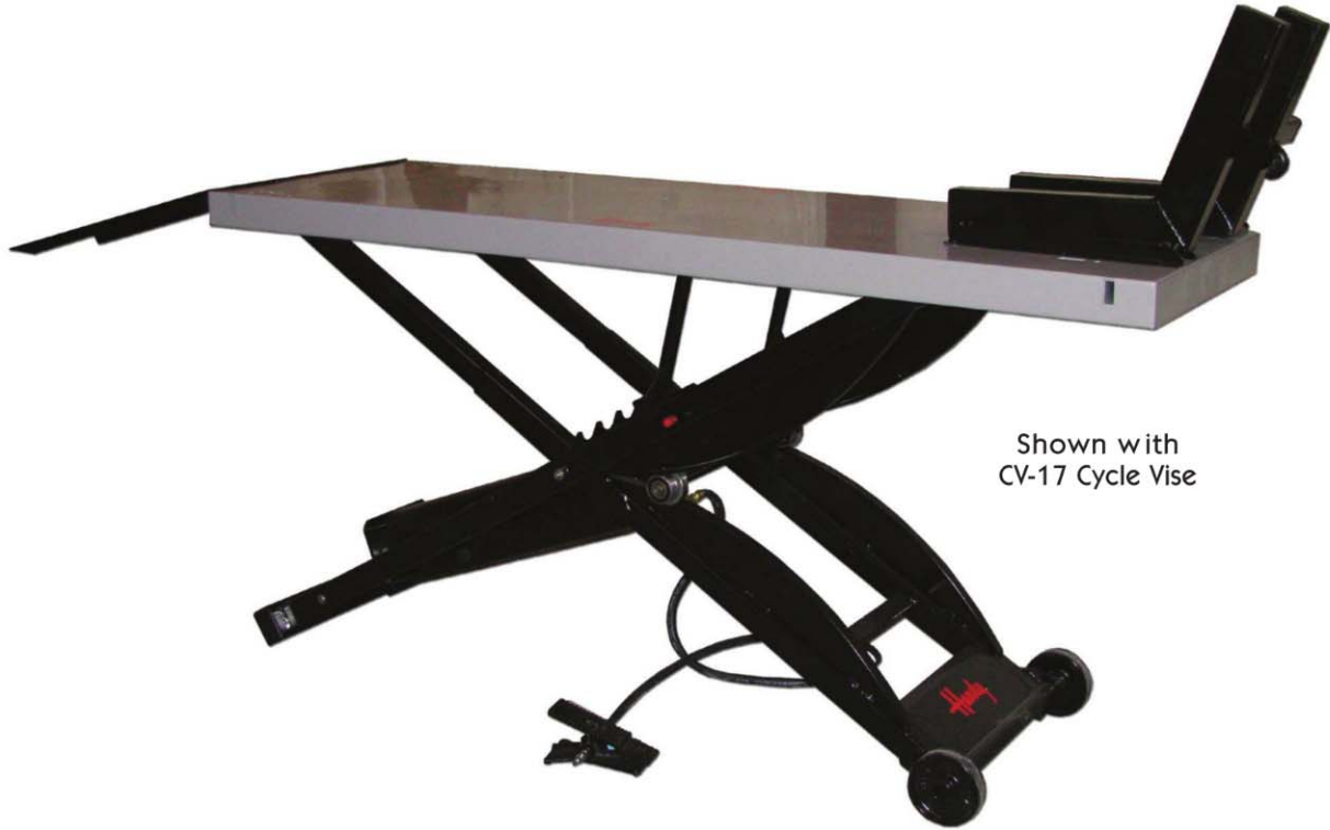
Shown with CV-17 Cycle Vise