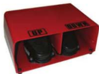
GUARDED FOOT PEDAL