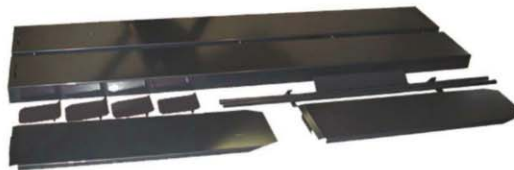
12" SIDE EXTENSIONS 20728 Expands the width of lift from 29-1/2" to 53" (2 each) and includes stabilizer & ramp extensions. Wt. 165 lbs.