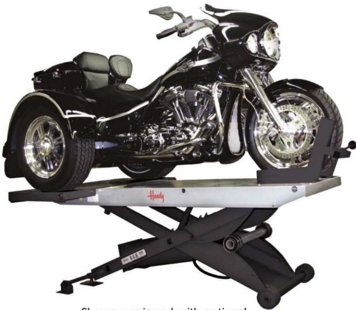
Shown equipped with optional Trike Kit and CV-17 Cycle Vise

B.O.B. 1500 AIR LIFT - ITEM 14472 B.O.B. 1500 AIR LIFT CE - ITEM 16013