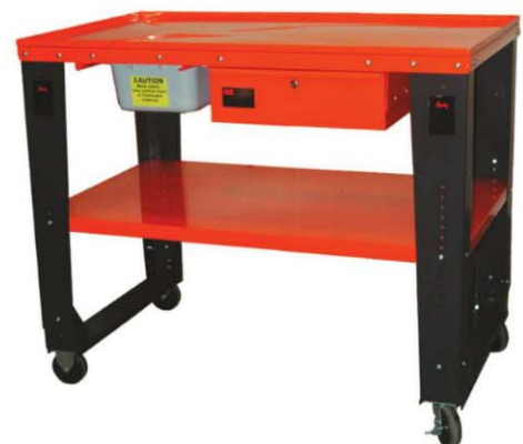
TEAR DOWN TABLE RED & BLACK - ITEM 11505