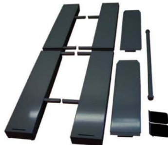
10" SIDE EXTENSIONS 16901 Expand the width of the table to a full 48" with the four-piece 10" Side Extensions. Ramp extensions are included. Wt. 212 lbs.