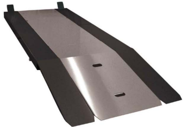
Optional four piece 10" Side Extensions