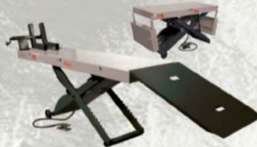
Shown with CV-17 Cycle Vise

The S.A.M. 2 1000 Lift is designed to lift bikes up to 1000 lbs. This lift was developed for bike professionals who needed a longer (93") and wider (28") work surface with the convenience of double drop panels (15" x 28") for easy maintenance.