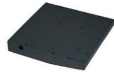
13" FRONT EXTENSIONS

12" SIDE EXTENSIONS 16002 Expands the width of lift from 24" to 48" (2 each) and includes stabilizer & ramp extensions. Wt. 125 lbs.