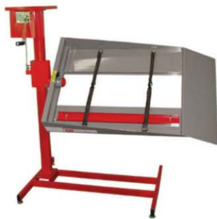
Adjustable wheel channel