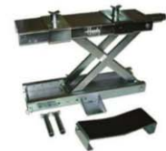
UNIVERSAL SCISSOR JACK 13008 Use on lift or on floor Wt. 43 lbs.