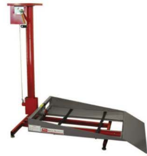
Lowers to 5" for easy loading

MANUAL MULTI-LIFT - ITEM 14691 ELECTRIC MULTI-LIFT - ITEM 10738