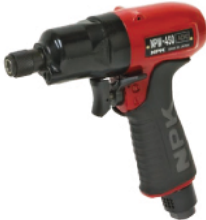
NPW-450A-DX0 1/4" Female Hex Pulsus Screwdriver