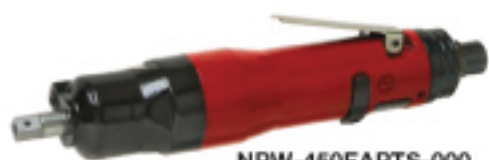
NPW-450EAPTS-000 3/8" Sq. Drive Straight Pulsus Wrench