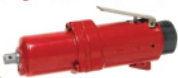
NPW-60SPTS 3/8" Sq. Drive Straight Pulse Wrench