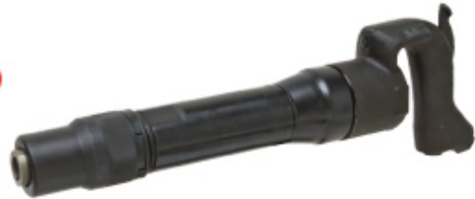
MP-W4R Chipping Hammer (sold with retainer)