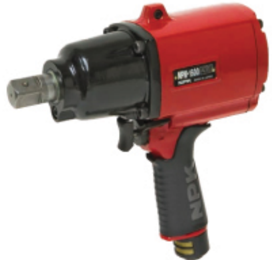
NPW-1600APTS-000 3/4" Sq. Drive Pulsus Wrench

NPK's "Pulsus" oil pulse mechanism tools feature a dual chambered air motor, which needs no lubrication and provides low vibration, low noise, and high durability. These lightweight, compact tools offer high performance and highly accurate tightening torque with easy torque adjustment. Other features include an ergonomic grip and a quick reverse that can be moved from the left side of the tool to the right side for left handed operation.