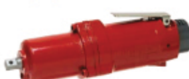
NPW-80SPTS 3/8" Sq. Drive Straight Pulse Wrench