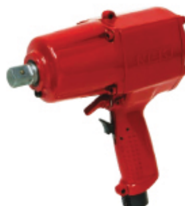
NPW-180PTS 3/4" Sq. Drive Pulse Wrench