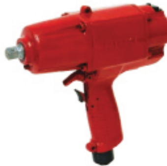
NPW-160TPTS 1/2" Sq. Drive Pulse Wrench