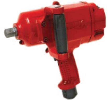
NPW-200TPTS 3/4" Sq. Drive Pulse Wrench