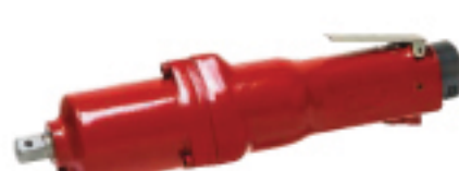
NPW-100SPTS 1/2" Sq. Drive Straight Pulse Wrench