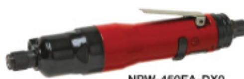
NPW-450EA-DX0 1/4" Female Hex Straight Pulsus Screwdriver