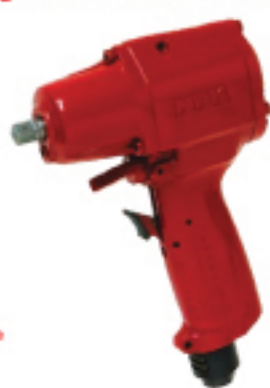
NPW-60PTS 3/8" Sq. Drive Pulse Wrench