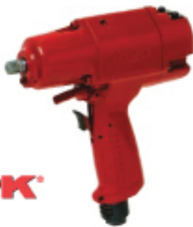
NPW-80TPTS 3/8" Sq. Drive Pulse Wrench