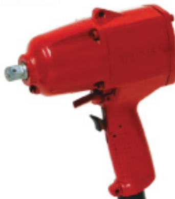
NPW-140PTS 1/2" Sq. Drive Pulse Wrench