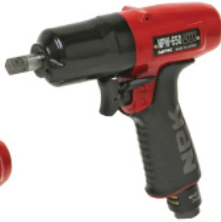
NPW-650APTS-000 3/8" Sq. Drive Pulsus Wrench