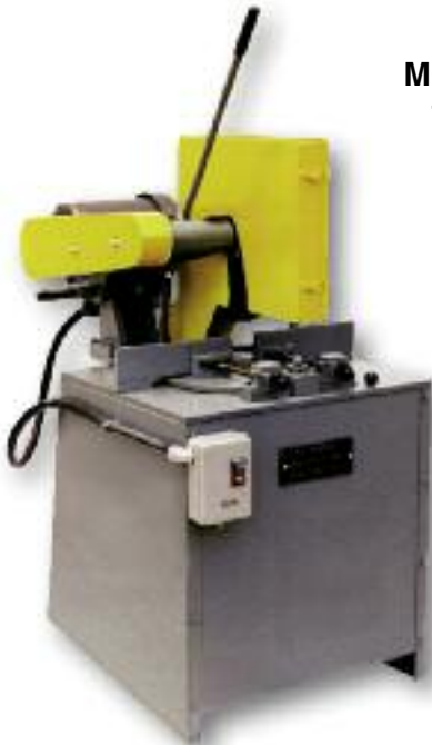
MODEL KM16-18 16 – 18" SAW

MODEL KM10 3 HP, 1 PH (110/220V) or 3 PH (220/440V); please specify voltage. Mitres either direction 45°. 5/8" wheel arbor. Positive index holes and up/down stops. Two cam lock vises, lever lock for table. Wt. 220 lbs.