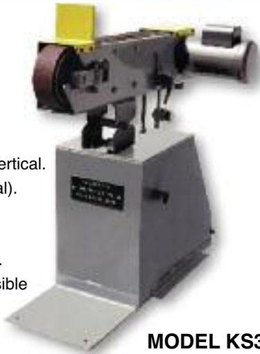
MODEL KS390 MODEL KS490

MODEL KS390 2 HP, 1 PH or 3 HP, 3 PH; please specify phase and voltage. Manual switch, air gauge with valve and regulator. Wt. 380 lbs.