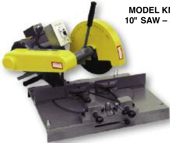
MODEL KM10 10" SAW – 3 HP