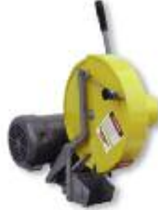
HS14AS 12" - 14" blade

HS14AS 12-14" blade, Non-ferrous arm assy., 5 HP, 1 PH (220 volt 60hz), 3 PH (220/440 60 hz), OSHA guard for carbide blades, 1" arbor, Spindle RPM 4400, 4 bolt mount, Manual switch, Please specify voltage, Weight: 240 lbs.