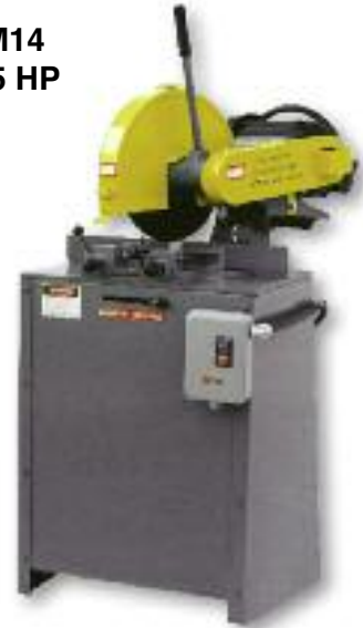
MODEL KM14 14" SAW – 5 HP

MODEL KM16-18 10 HP saw duty, 3 PH motor; please specify voltage 220/440. Uses 16" or 18" abrasive wheel (not included). 1" wheel arbor. Mitres either direction 45°. Two cam vises. Low voltage manual starter. Dry model only (not available wet). Wt. 730 lbs.