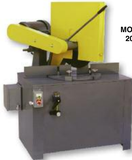
MODEL KM20-22 20 – 22" SAW

MODEL KM14 5 HP, 1 PH (220V only) or 3 PH (220/440V); please specify voltage. Mitres either direction 45°. 1" wheel arbor. Positive index holes and up/down stops. Two cam lock vises, lever lock for table. Wt. 400 lbs.