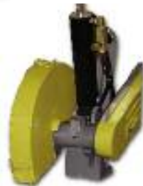
Option: PH-14 air/oil Power down feed